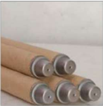
Thermocouple Temperature Tips MK-VI 900mm