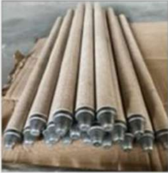
Thermocouple Temperature Tips MK-III 600mm