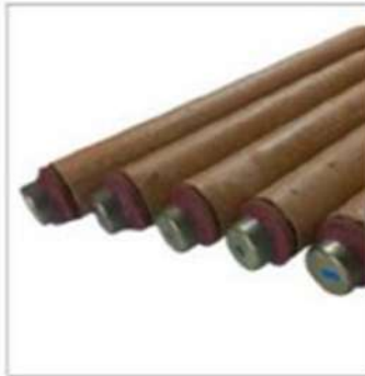
Lollipop Sampler 600mm