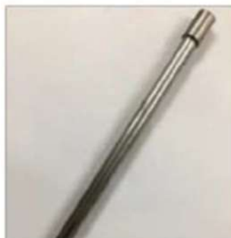
Lancing Pipe for Thermocouple Temperature Tips (S.S)