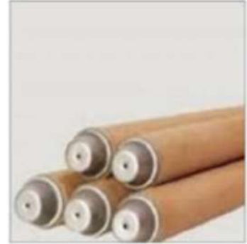
Thermocouple Temperature Tips MK-VI 600mm