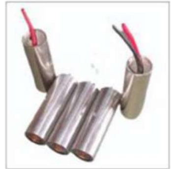
Receptacle & Housing for Thermocouple Temperature Tips.