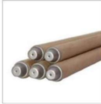
Thermocouple Temperature Tips MK-III 900mm